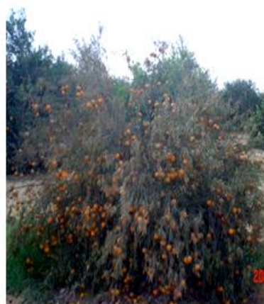
Figure 1: Image field for effect of heavy bearing on mandarin tree.

Murcott collapse: considered a clear example for alternate bearing phenomena, it occurs when Murcott mandarin trees loss of their leaves and fruit rapidly during the fall or winter of an ON year [15].