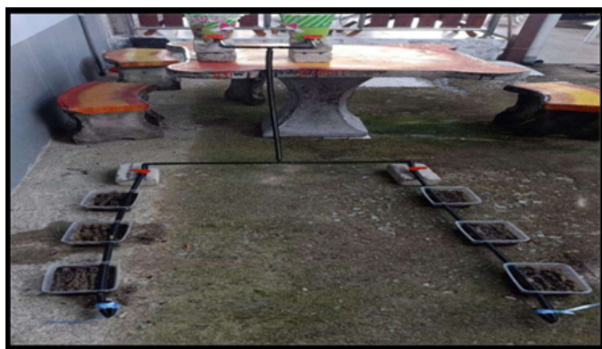
Figure 2: Mini fertigation system at house.

Mini fertigation setup is the simple fertigation with rainfall water harvester that cheap in cost and easy to use with recycling some product such as fermentation wastage of kitchen and more as bio fertilizer use in this mini fertigation setup. The material use is 2 tanks (more bigger more better) for rainfall water harvester that connects with the PVC pipe from the roof house. The best recommend by using filter before water flow from the roof direct to tank for prevention from toxic and more. The filter can be use like gravel to filter the toxic that come from atmosphere such as nitrogen oxide combine with water to become weak acid that not suitable for our crop. The piping system is normally as fertigation system but this mini fertigation system is very simple that objective from this project is everyone can become planters only at their home for their own consumption. This mini fertigation do not required pump either big or small pump, it only use gravity force from higher place to lower place. That mean the tank is at higher place from the crop. The piping for mini fertigation is required only 3 meter of 20mm black LDPE, 4 L connector (20mm size), 2 T connector (20mm size), 4 stopcocks, and 2 straight joint with grommet rubber (20mm size). All for this things and plus with planting container it only cost RM30.00 for making mini fertigation system at home as in figure 2.