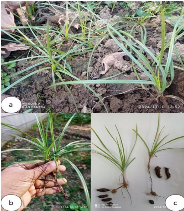
Figure 2: Shows plant Cyperus rotundus a. & b; Leaves, Stem, Rhizomes and tuber in fresh plant and from market sample c.