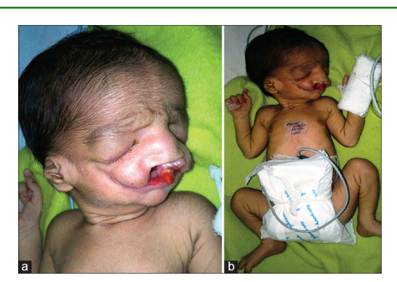
Figure 4 : Image of a baby with Treacher-Collins syndrome with related disorders. [1]

Treatment of patients includes respiratory and nutritional disorders in infants and toddlers, as well as timely treatment of hearing disorders with hearing aids .Treatment includes methods to improve breathing and improve airway function. Treatment and repair of the oral roof is usually done at the age of 1-2 years. Jaw and eye treatment is often done at the age of 5-7 years. Ear correction is usually treated after age 6, and jaw displacement is usually treated before age 16. Of course, there are other treatments whose scientific results have not yet been confirmed. Including :Treatment of Treacher-Collins syndrome in the mother's uterus by manipulating a gene called p53. Adding stem cells to bone and cartilage to improve surgical outcomes, treat skull and facial problems [1,7,8].