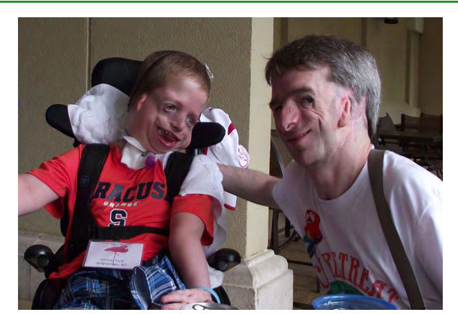
Figure 1: Image of patients with Treacher-Collins syndrome with related disorders [1].

patients and may be associated with cleft lip. Increased hair growth in the cheeks and large mouth are other findings.