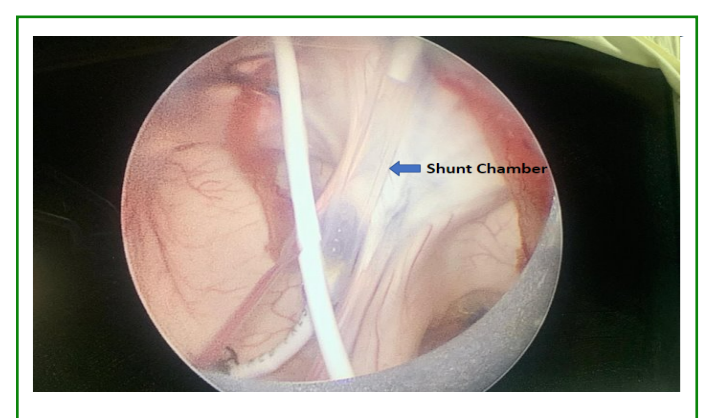
Figure 2: Intraoperative endoscopic image showing complete intracranial migration of ventriculoperitoneal shunt with shunt chamber in lateral ventricle.