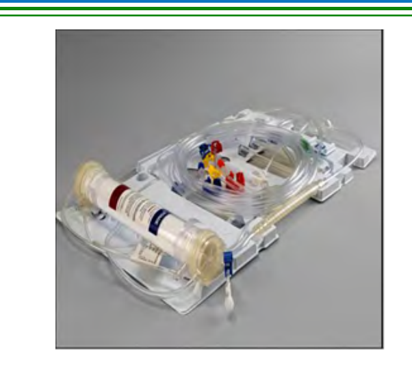
Figure 2: Pre – packaged kit containing dialyzer filter and blood lines.