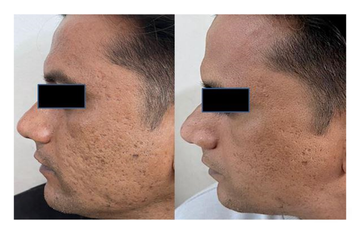
Figure 2(A&B): Rolling, icepick and boxcar acne scars in a 29-year-old male patient before and after three sessions of fractional resurfacing using 25 mJ with a density of 15%, showing mild to moderate improvement; (A) right cheek, baseline; (B) right cheek, post treatment.