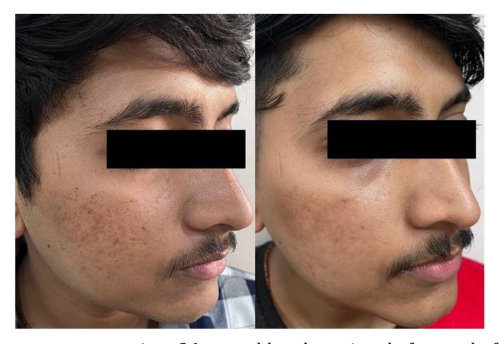
Figure 3(A&B): Rolling and boxcar acne scars in a 26-year-old male patient before and after three sessions of fractional resurfacing using 25 mJ with a density of 15%, showing moderate improvement; (A) right cheek, baseline; (B) right cheek, post treatment.