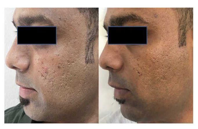
Figure 1(A&B): Rolling and boxcar acne scars in a 35-year-old male patient before and after three sessions of fractional resurfacing using 25 mJ with a density of 15%, showing moderate improvement; (A) right cheek, baseline; (B) right cheek, post treatment.