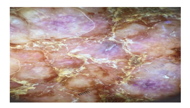
Figure 3: Dermoscopy showing a rainbow pattern with yellowish crusts.