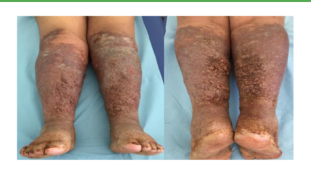
Figure 1: Multiples confluent papules and nodules into a large warty cupboard of the feet and legs.

showing a vascular proliferation of fusiform cells (Figure 5) with immunohistochemical staining positive to Anti-CD34 anti body (Figure 6). Biological assessment revealed adrenal insufficiency and CT scan of vertebral compression of osteoporosis. Given the isolated cutaneous involvement, Therapeutic abstention with progressive stopping of corticotherapy was decided. At follow-up visits, the patient reports a collapse of the lesions after stopping corticosteroid therapy. The current decline is 4 months.