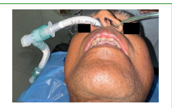
Figure 2: Tube Allowed Taking its Natural Inclination along the Surface of the Nasal Ala, Laterally.

In our institution, all the head and neck patients undergoing surgery are intubated via the nasal route. Because of prolonged surgical hours and post-surgery intubation time ranging from 24-48 hours, these patients are potential candidates for developing pressure induced alar sores or alar necrosis. Hence, for all patients we use the following modifications in the intubation technique which has helped us in drastically decreasing the rate of nasal alar pressure sores.