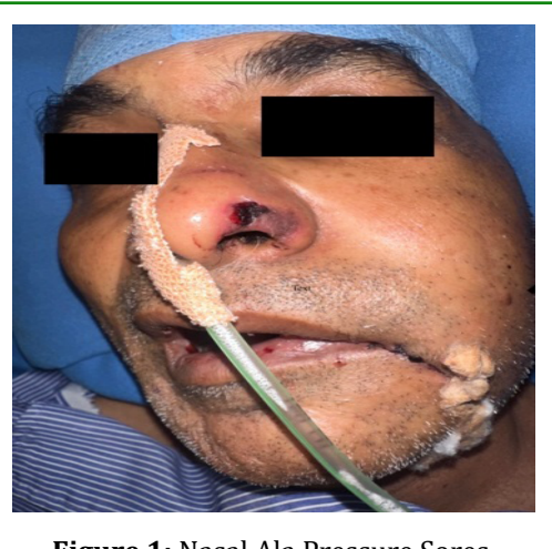
Figure 1: Nasal Ala Pressure Sores.

intubation include epistaxis turbinectomy or in rare cases, even retropharyngeal dissection, the discussion of which is beyond the scope of this paper [3]. In this paper we have discussed about simple yet novel techniques that we employ in our institution that aids us in avoiding this potential complication.