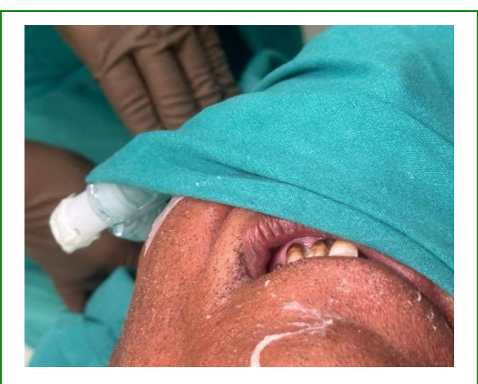
Figure 5: The First Surgical Drape should always follow the Direction of the Natural Inclination of the Tube.

The first surgical drape should always follow the direction of the natural inclination of the tube and should not provide any additional pressure to the tube in any other direction (Figure 5).