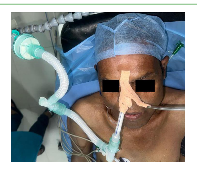
Figure 6: Usage of an Extra Catheter Mounts to the Original Endotracheal Tube.

Usage of an extra catheter mounts to the original endotracheal tube to increase the overall length of the tube to avoid any unnecessary and unintentional drag to the tube against the skin by the surgeons (Figure 6).