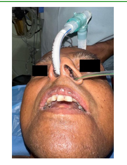
Figure 3: Tube not to be Forcefully Secured in a Perpendicular Direction.

2 and is not forcefully secured in a perpendicular direction Figure 3 or in the direction opposite to its natural inclination. Sometimes however, it is the surgeon's preference to have the tube tilted opposite to the surgical side. In those cases, the tube was allowed to assume its natural position after intubation through the opposite nostril and if the tilt was medial the tube could be safely tilted against the columella. In our experience, it is a safe procedure and columellar pressure sores or necrosis have not been observed.